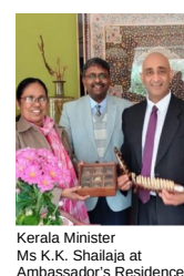
Kerala Minister Ms K.K. Shailaja at Ambassador's Residence