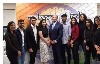
Ambassador with students representing various Universities

6. Indian Constitution Day: Embassy hosted (26 Nov) India Constitution Day in new Embassy premises. Function was oriented towards students from various educational institutions such as Trinity College Dublin, Univ College Dublin, Dublin City Univ and Dublin Business School. Discussions centered around upholding of Constitution and democratic values, building of democratic links between India & Ireland, as well as delivering message of equality, women's rights and children's rights. It was also an occasion to discuss potential joint projects with Universities.