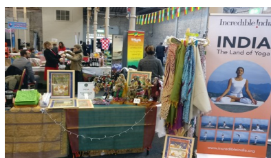
Indian corner at Charity Bazaar