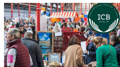
Charity Bazaar @ RDS, Dublin